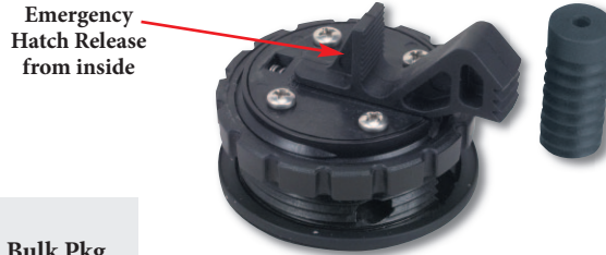
Self-Adjusting, Ratcheting Slide Action Design