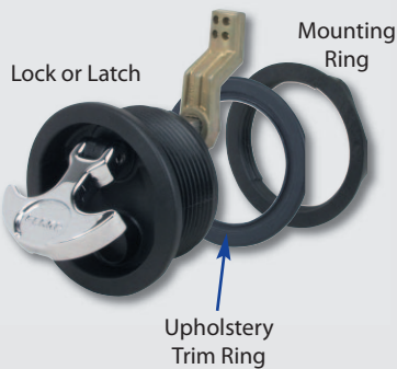
Fig. 1097 Upholstery Trim Ring