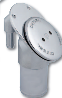
Fig. 0579 Vented