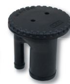
Fig. 0543 Water