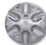
Alternate Style Cap Available. Contact Factory.