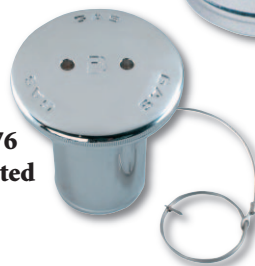
Fig. 0576 Non-Vented