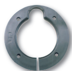
Fig. 0540DPRBLK 2 Mounting Ring