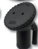
Fig. 0542 Water