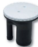
Fig. 0543 Gas