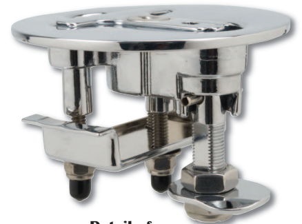
Detail of Concealed Fasteners Bottom Plate