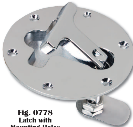
Fig. 0778 Latch with Mounting Holes