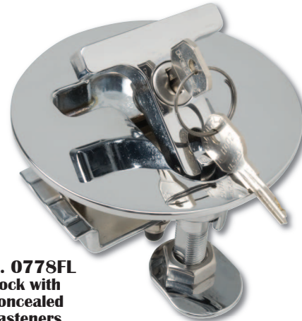
Fig. 0778FL Lock with Concealed Fasteners

For Securely "Dogging" (Fastening) Deck Hatches