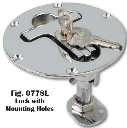
Fig. 0778L Lock with Mounting Holes