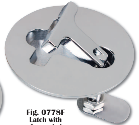
Fig. 0778F Latch with Concealed Fasteners